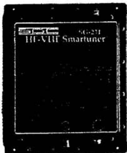
SG-231 Coupler Catalog Number 54-17

Do YOU want to be heard? OF COURSE! Then use the SGC Smartuner™ - the Essential link between your HF transceiver and antenna . Matching at the transceiver is good, but matching at the antenna is better. SGC Smartuners are designed to do just that. They operate independently to provide the best match between the feed line and the antenna, totally eliminating SWR problems.